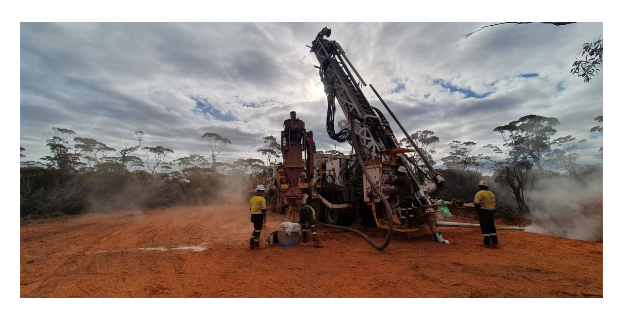
Figure 1 RC drill rig on the first drill hole at Pegasus

Bryah's prospects to a path to production following a discovery have been enhanced following Mineral Resources' (MinRes) acquisition of the Poseidon processing plant<sup>3</sup> where it is planning a regional lithium processing hub."