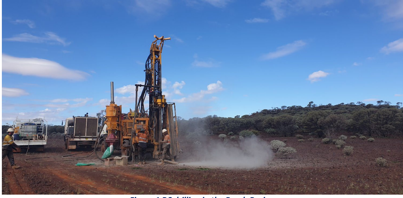
Figure 1 RC drilling in the Bryah Basin

The strategy to target potential manganese under cover and assess new areas to reach a critical mass is aimed at restarting mining operations in the area. Results from the March drill program are still expected through the assay laboratories in the next month."