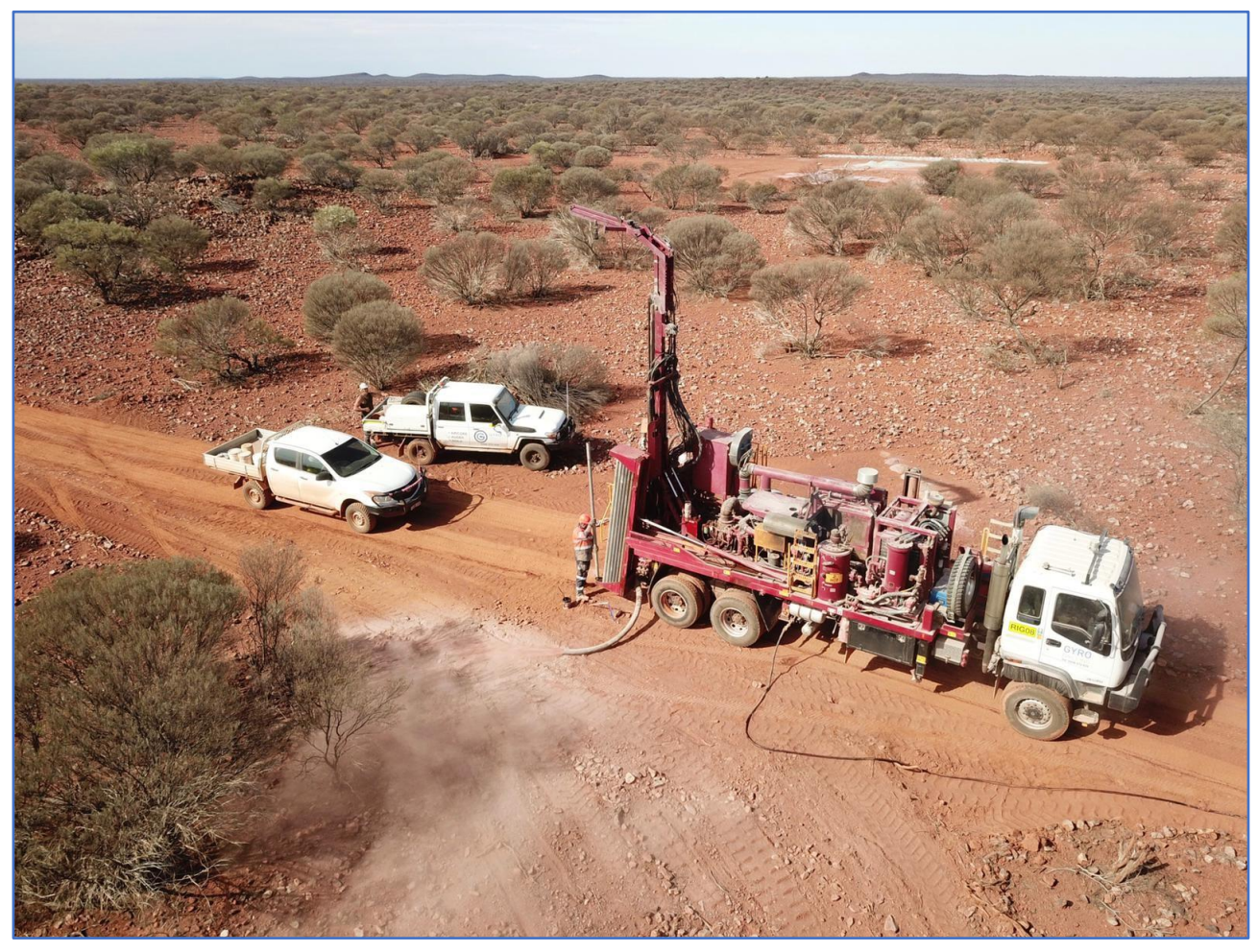
Plate 1 – Aircore Drilling at Windalah