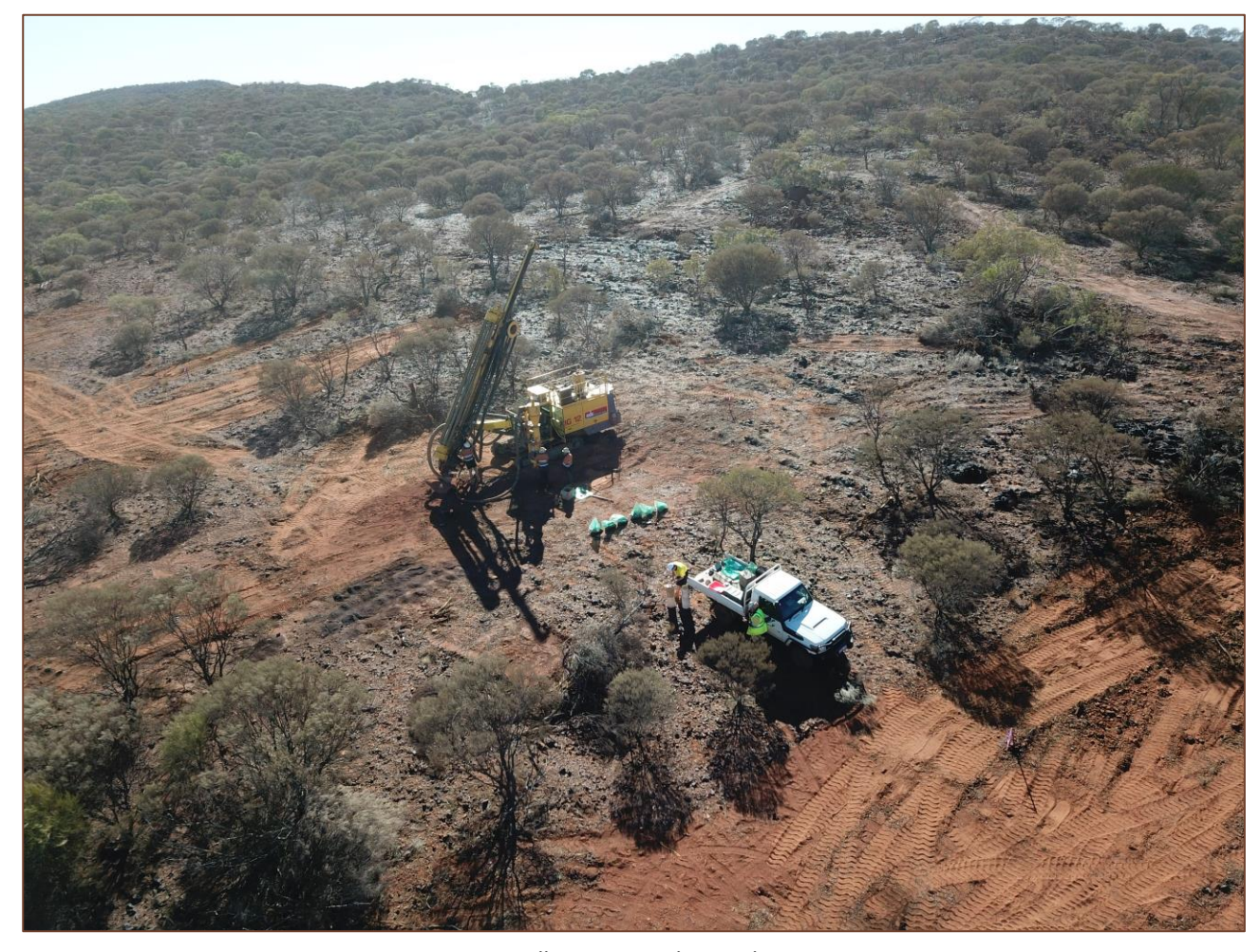
Figure 3 - Drill Rig at Brumby Creek Prospect

OMM is now funding an additional $500,000 of exploration expenditure under Tranche 2 to increase its JV interest to 30%.