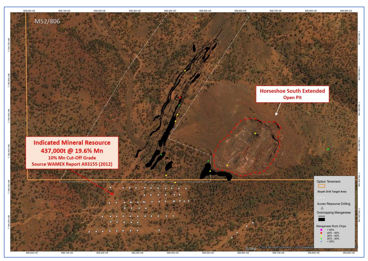
Figure 3 – Map of southern part of Horseshoe South Mine.