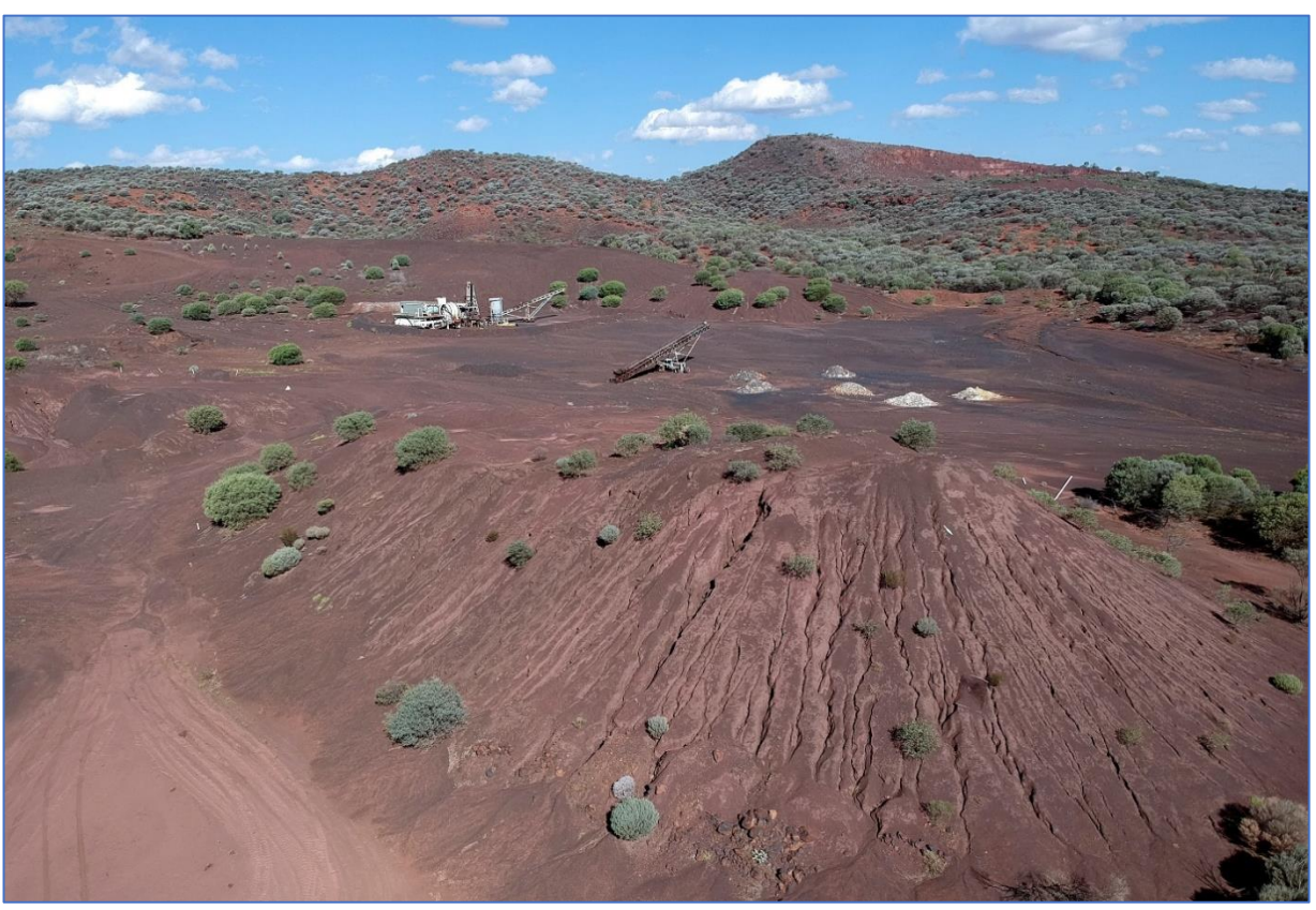
Plate 1 – View of PMI's DMS plant and manganese stockpiles at Horseshoe South Mine.