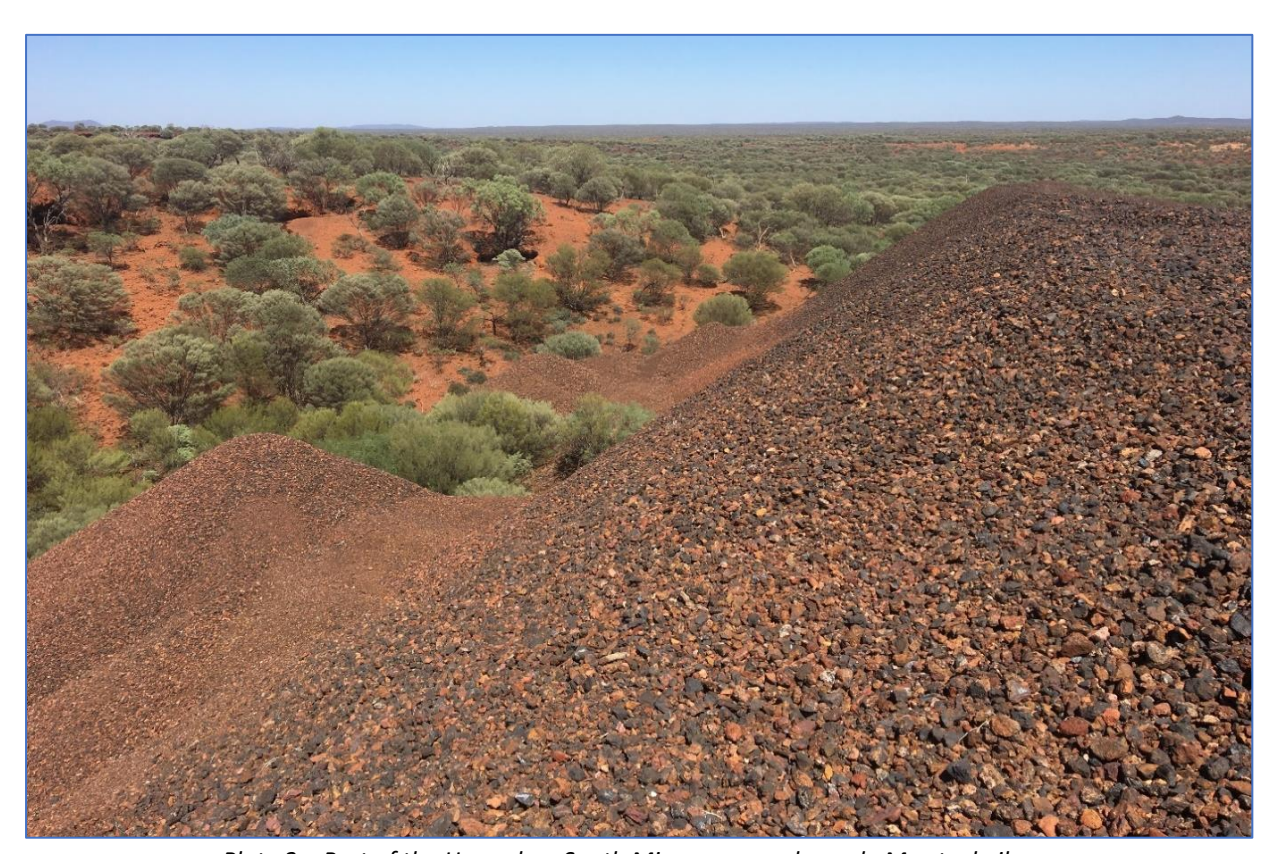
Plate 2 – Part of the Horseshoe South Mine coarse sub-grade Mn stockpile.