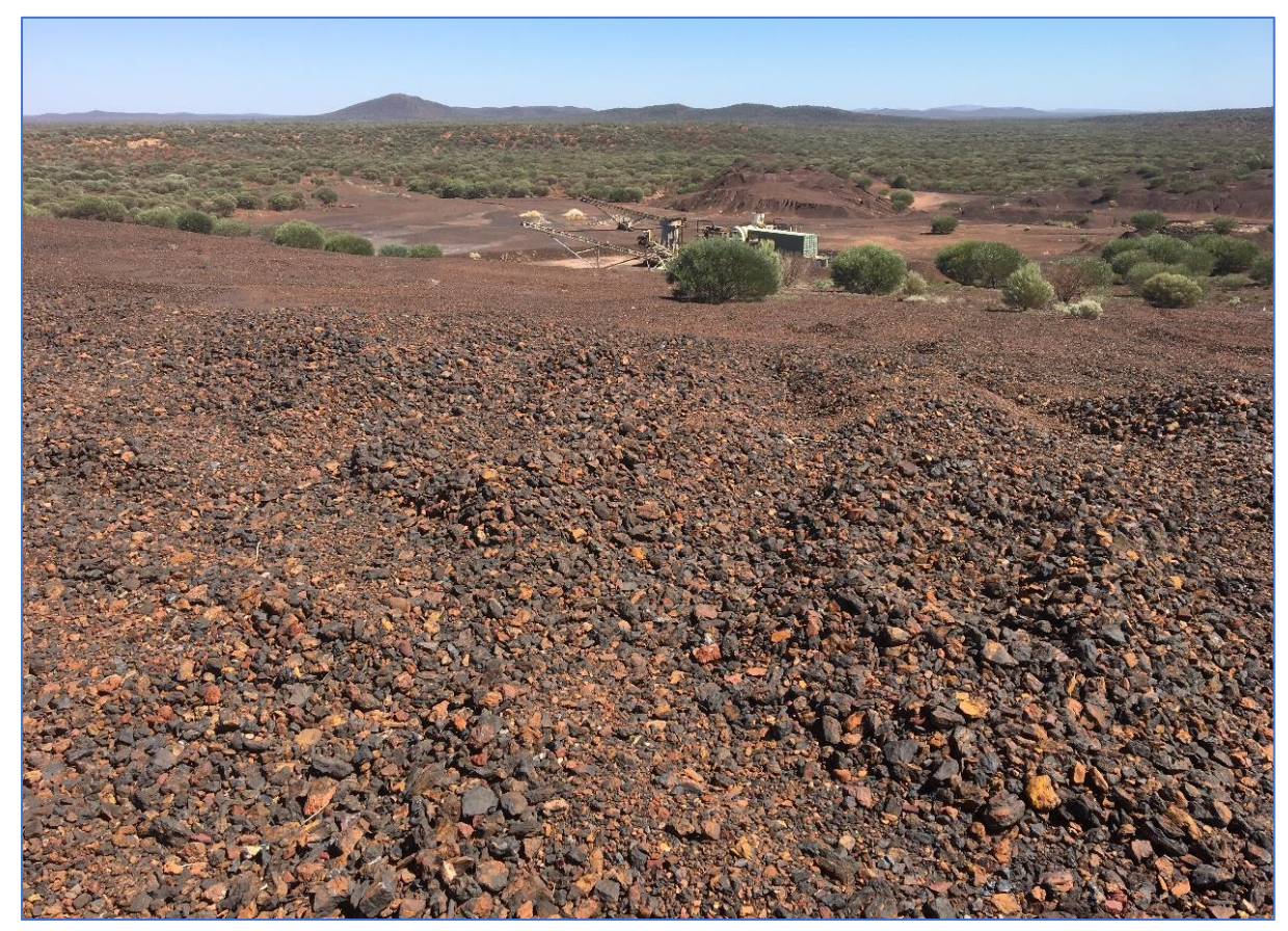
Plate 4 – View of Horseshoe South Mine taken from the top of the coarse sub-grade Mn stockpile (foreground), showing MIN's beneficiation plant and fine sub-grade Mn stockpiles (background).